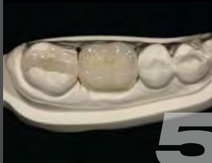
STEP 5 Final restoration created by laboratory