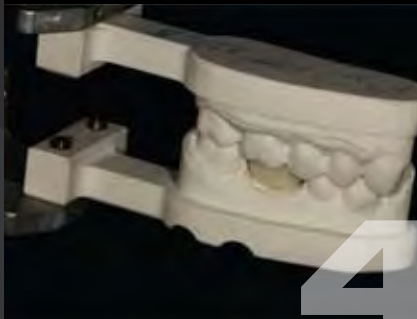
STEP 4 CAM model created by Cadent