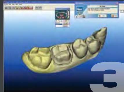
STEP 3 CAD model created by laboratory