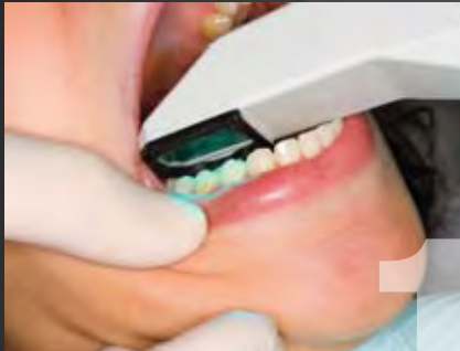
STEP 1 Digital scan by dentist